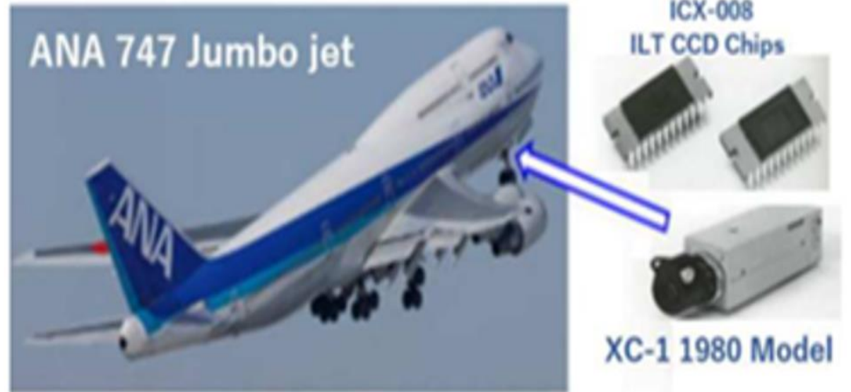
SONY 1980 Two-chip CCD Color Video Camera XC-1.