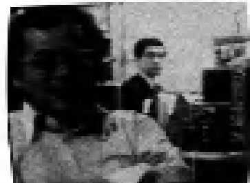
Fig. 19. TV picture of camera system. Left: Auto-focusing effect seen working. Right: maximum light intensity through the lens when convergence is about ten times of the maximum focusing range of the imager.