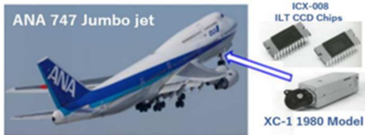
SONY 1980 Two-chip CCD Color Video Camera XC-1.